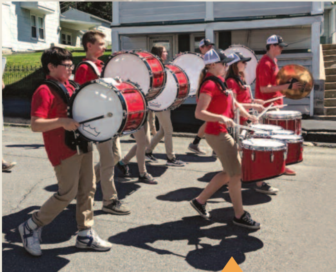
North Schuylkill Band Boosters received 2018 grant funds to "Give the Beat Back to the Band" through the purchase of smaller drum harnesses.