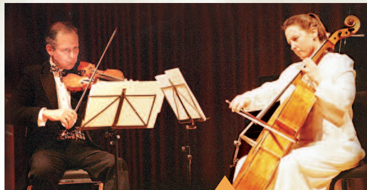
Gabriel Chamber Ensemble