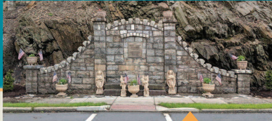
Hoffman Boulevard Memorial, Ashland, PA

The Pediatric Autism Services Fund was established in 2018 to provide financial assistance with out of pocket expenses for therapy sessions for children who have been diagnosed with Autism, and have been prescribed to receive Applied Behavior Analysis (ABA) therapy plus Occupational (OT) or Speech Therapy at a center-based provider in, or with a satellite office in, Schuylkill County, PA.