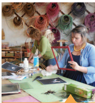
Walk In Art Center, Schuylkill Haven, PA

Richard W. and Dolores D. Adams Memorial Scholarship Blaze Belfiore Memorial Scholarship Butler Township High School Alumni Scholarship