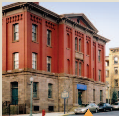
Schuylkill County Historical Society, Pottsville