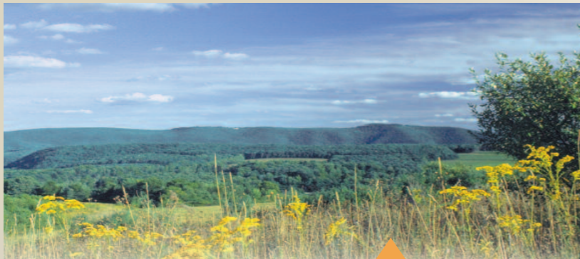
View of the Blue Mountains from Schuylkill County