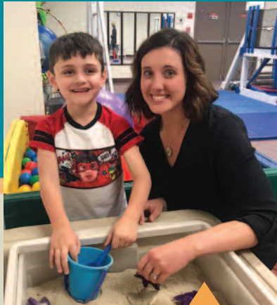
Pediatric Autism Therapy Facility