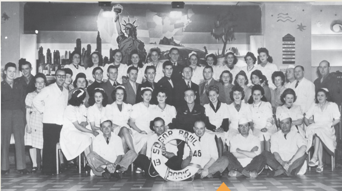
The Sugar Bowl, Paris, France