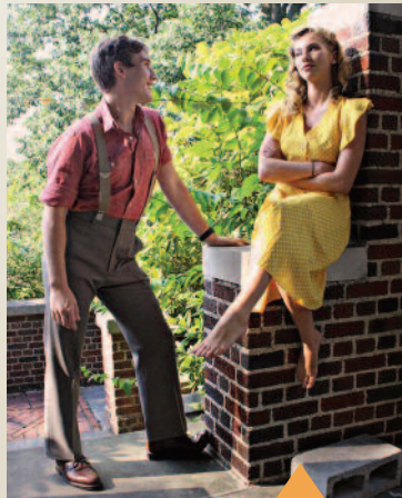
Schuylkill Free Shakespeare

Schuylkill County Fire Museum Schuylkill County Historical Society Schuylkill Haven Area EMS Schuylkill Haven Free Public Library Schuylkill Haven Island Committee Schuylkill Historical Fire Society Shamokin/Coal Township Public Library