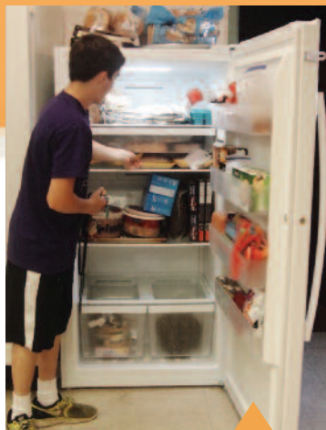
St. Joseph Center for Special Learning received funds to purchase a freezer for their kitchen from a grant application.

Pottsville Lions Charities, Inc. Scholarship Hunter William Renninger Memorial Scholarship The James J. and Mary Edith Rhoades Scholarship Schuylkill Elder Abuse Prevention Alliance Scholarship Schuylkill Haven Lions Community Charities Healthcare Scholarship Fred G. Smith Golden Rule Scholarship