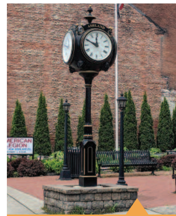
American Legion Post 434 Ashland, PA

Ethel M. Jones Ermert, R.N., Memorial Award in Obstetrics Stephen Fago Memorial Award Robert C. Fetterolf Memorial Award First Baptist Church of Ashland Award T. Stuart Goynes Memorial Award Emma T. Irwin Memorial Award William J. Jones, Jr. Memorial Award Betsy Rubright Kent Memorial Award Paul M. Krukas Memorial Award James R. Kruss Memorial Award Paul Lohin Schuylkill River Watershed Conservation Award Rae Ann Lubold Memorial Award Mechanicsville Ladies Auxiliary Award Andrew Neidlinger Memorial Award Joseph M. O'Neill, Jr. Memorial Award Jonathan "Feet" Palubinsky Memorial Award Pottsville Catholic Alumni Award Maud M. Prichard Memorial Award William J. "Rex" Roberts Memorial Award David R. Schmaldienst Music Award Schuylkill County Medical Society Alliance Award