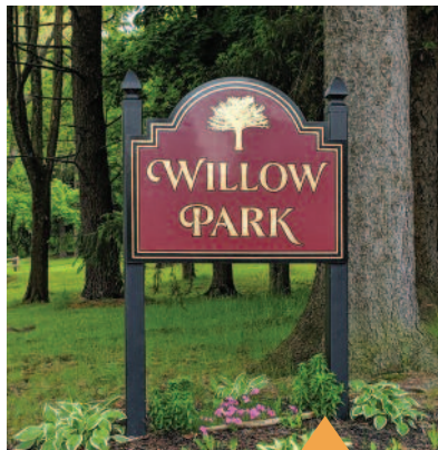
Willow Park, Ashland PA

Ashland Area Scouting Fund Ashland Mutual Fire Insurance Company Fire and Safety Fund Arnold Delin Education Fund The Diversity Fund for Schuylkill County Fenstermacher/Hadesty's Legacy Fund Ben Franklin Trust Dr. Gail D. Mackey, VMD, DABVP Animal Fund Isabelle Ross Mettam Performing Arts Fund The Nature Fund The Pediatric Autism Services Fund Reagan Reilly Hope Fund Charles Werner Endowment Fund