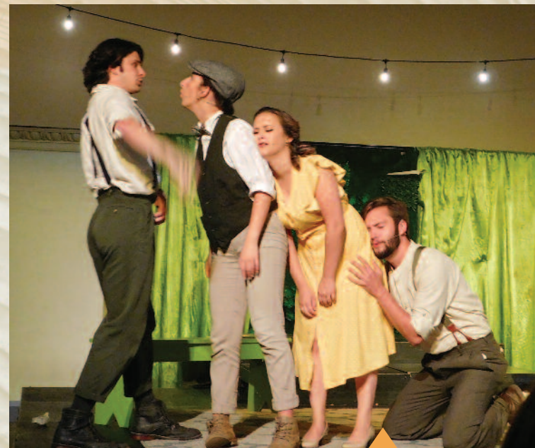
"As You Like It" performed by Schuylkill Free Shakespeare

The Community Foundation encourages philanthropy at all levels, provides comprehensive donor services and responds to changing needs and opportunities in the community including: Animal Welfare, Arts & Culture, Diversity, Education, Environment, Health & Wellness, and Human Services.