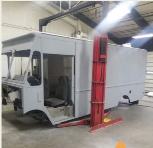
STC "The Food Truck Fund"

The annual distributions of this Fund shall be used annually for the use and purposes of the Schuylkill County Conservancy. The Schuylkill County Conservancy's mission is to protect and enhance the quality of life in Schuylkill County by conserving farmland, open space, rural heritage, streams, wetlands, waterways, forests and other natural resources.