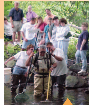
Schuylkill Conservation District fieldwork